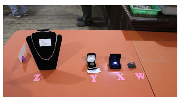
Find of the year Competition, see results on page 5.