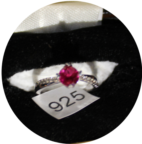
Silver - 925 Silver Ring