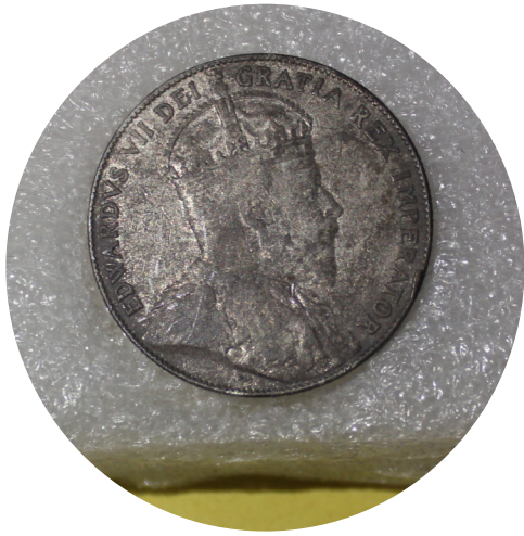
Coin - King Edward Canadian Silver Coin - 1910