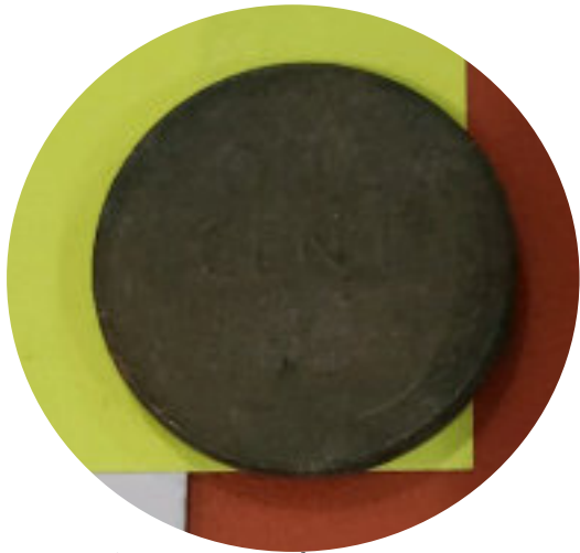
Coin - 1946 Wheat Penny