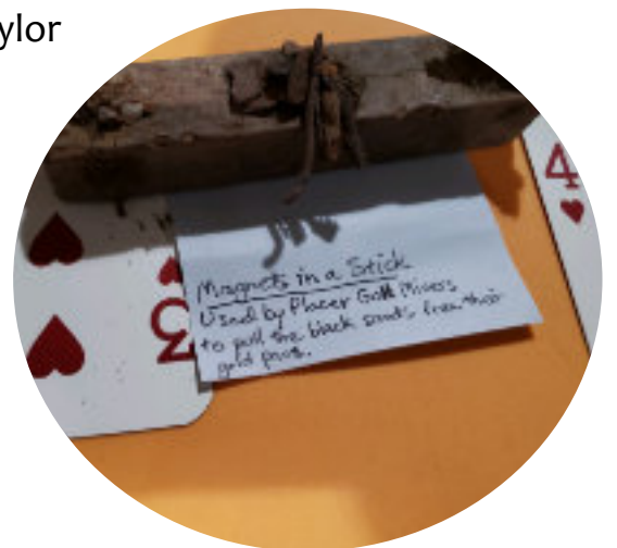
Artifact - Magnets in a Stick Lars Earl