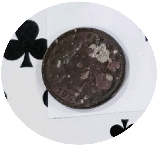
Coin - 1904 V Nickle Eddie Vlassis