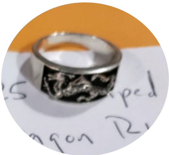
Silver - 925 Dragon Ring Marc Canigiula