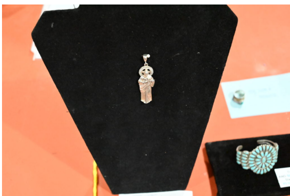
Silver - 925 Silver Medallion - Larry Royal