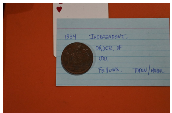
Artifact - Odd Fellows Medallion - Eddie Vlassis