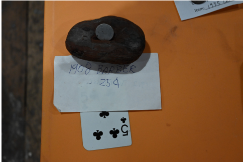
Coin - 1908- Barber Quarter - Justin Fletcher