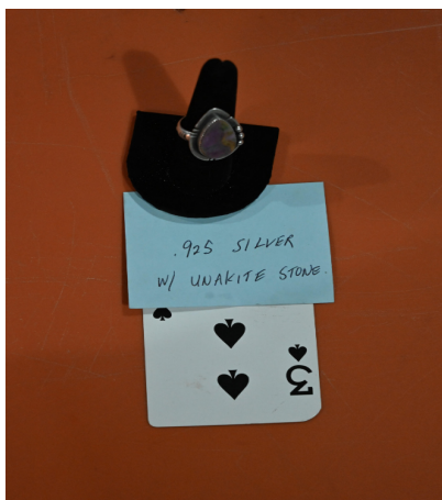
Silver - Silver Ring - Eddie