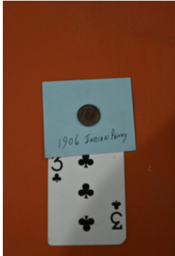
Coin - 1906 Indian Head - Eddie