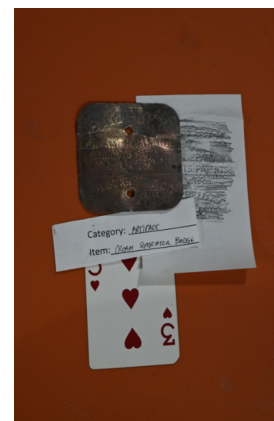
Artifact - Badge - Sean