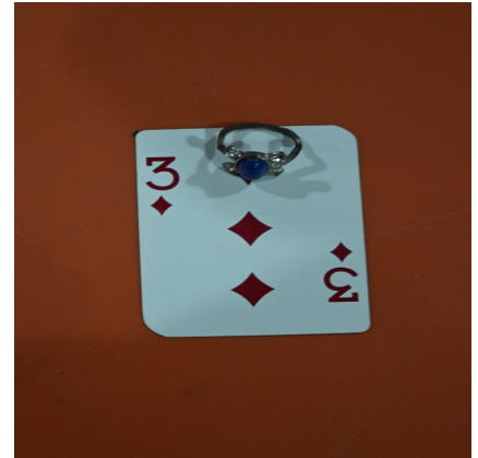
Jewelry - Ring With Blue Stone- Wayne