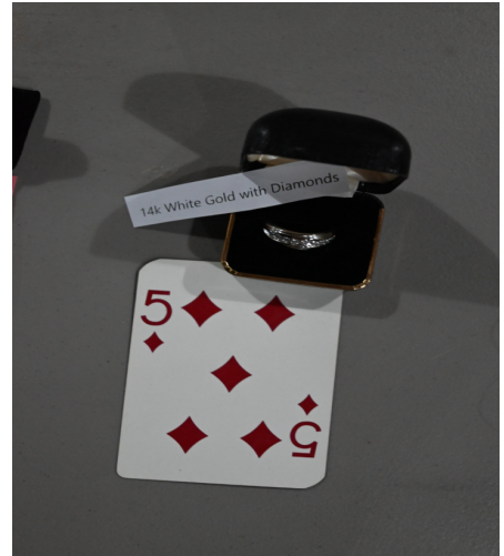
Jewelry - Ring With Diamonds - Justin.