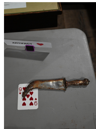
Artifact - knife - Gerry.