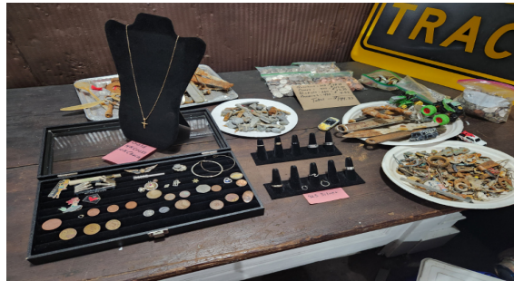
Show & Tell -Pat.