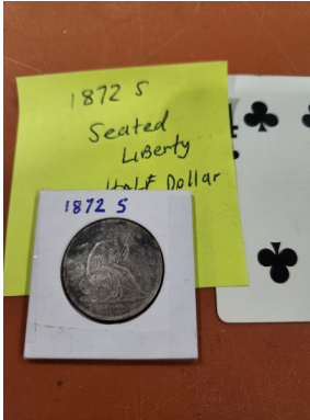
Coin -1872 S Seated Half - Eddie