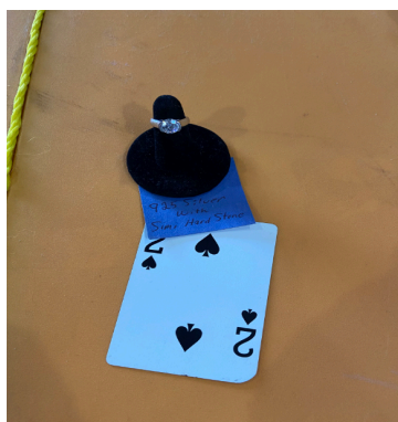
Silver -Ring With Stone- Pat.