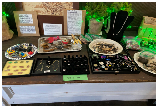
Show & Tell -Pat.